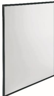
EP0350B / EP0450B Black Matte finish