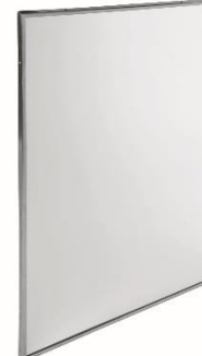
EP0350CS / EP0450CS Satin finish