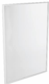
EP0350 / EP0450 White finish

Fixed with a steel or AISI 304 stainless steel frame