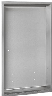
KT0016VCS Satin finish