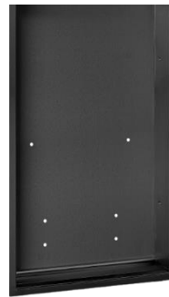
KT0016VCSB Matte black finish