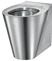
SN0125CS Satin finish