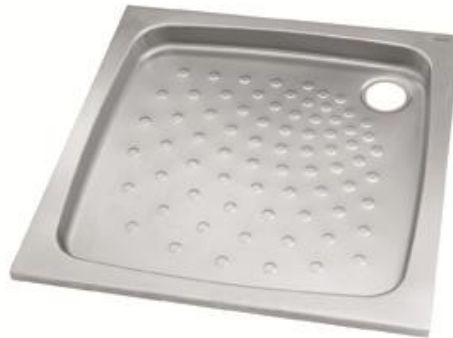
SN0800CS Satin finish